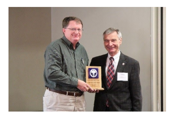
SC Department of Mental Health

A grant from the Emily Hall Tremaine Foundation has allowed the Energy Office to provide tangible recognition for those public entities that have met their mandated 20 percent reduction in energy intensity since the year 2000.